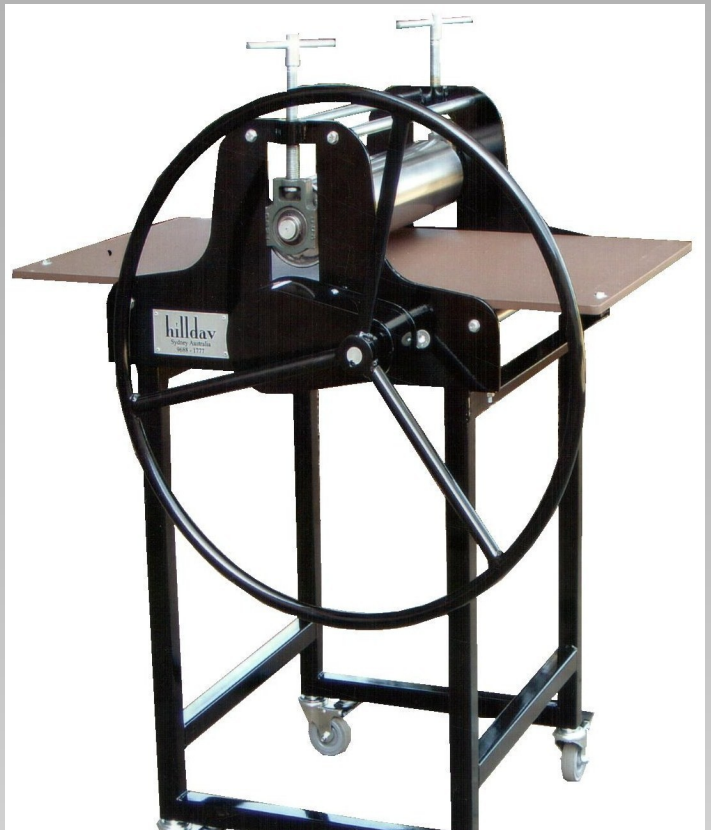
Reduction Drive 18-36 Small Model Etching Press, with Stand and Set of Lockable Castors.

GEAR REDUCTION DRIVE. Reduction presses use a roller chain drive, this has the advantage over a gear wheel because the chain wraps around the sprocket. Giving a Ratio of 2.5:1. This makes it easier to drive the bed through the roller.