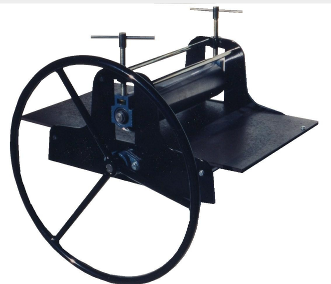
Direct Drive 18-36 Small Bench Model Etching Press.