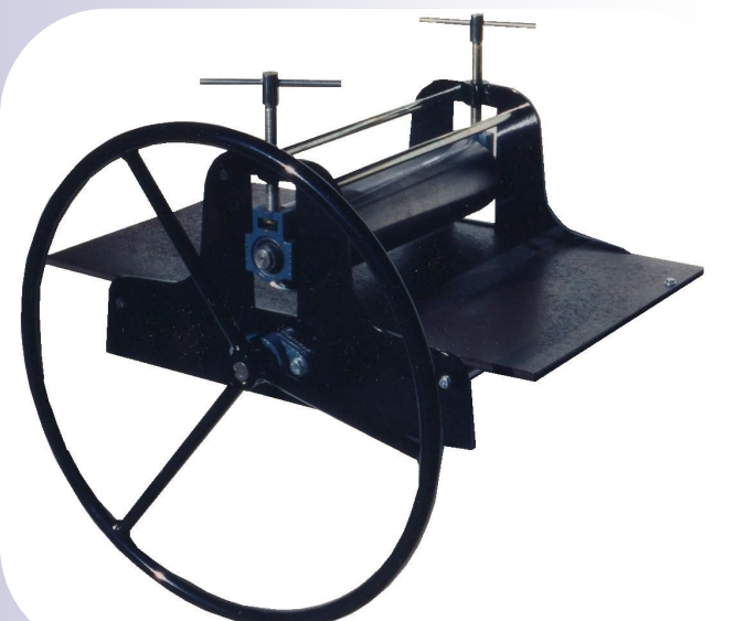
Direct Drive 18-36 Small Bench Model Etching Press.