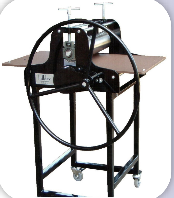
Reduction Drive 18-36 Small Model Etching Press, with Stand and Set of Lockable Castors.

GEAR REDUCTION DRIVE. Reduction presses use a roller chain drive, this has the advantage over a gear wheel because the chain wraps around the sprocket. Giving a gear driven Ratio of 2.5:1. This makes it easy to drive the bed through the roller.