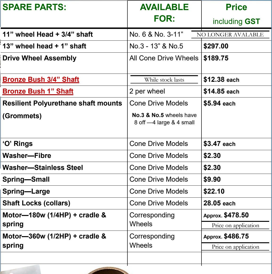
Drive wheel Assembly