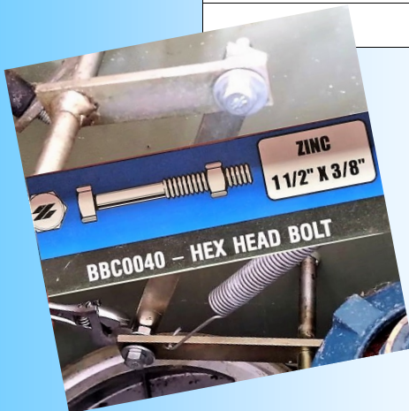
Small Spring (Between motor and wheel head, hidden behind drive wheel Assembly)

There are two Bolts and nuts that hold the connection rod in place, if the grommet that they go through has been damaged you may need to replace one of these.