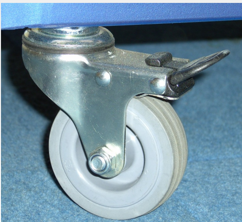
Heavy Duty Lockable castors can be fitted to the stand to make moving the press easier.

The Large model Direct drive presses are available only in direct drive, (Where the Hand wheel is connected directly to the bottom roller) The Larger model Direct Drive presses can be either Bench mounted or come with a stand. A set of heavy duty lockable castors can be fitted to the stand. This is very handy to move the kiln out of the way when not being used.